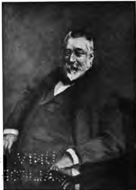
From the painting by Sorolla in the Hispanic Society of America